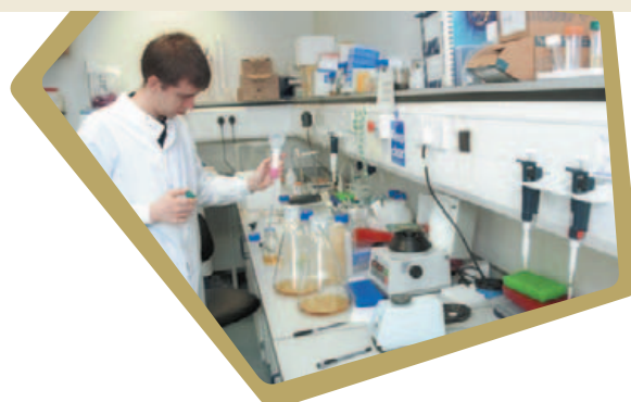
Top Students at Laban Left London BioScience Innovation Centre

All of this makes London one of the world's true knowledge capitals, a place for people to learn and develop, and for businesses to find the skills they need to succeed.