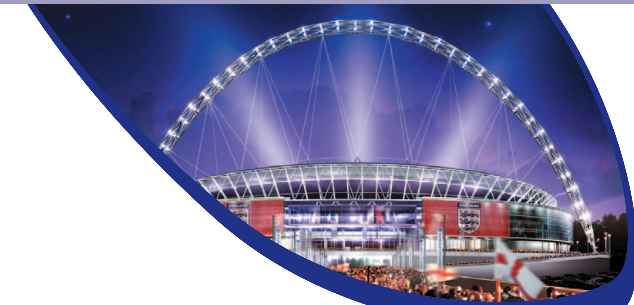
Top far left City Hall and Tower Bridge Top right London Eye Left Wembley national stadium

London has the key advantage of being able to provide an environment in which these developments can succeed. It is home to a sophisticated and mature real estate development and investment industry, which enables innovative partnerships between the private and public sectors to be brokered and delivered. London leads the way in demonstrating how well the two work together, with other recent successes including Hammersmith, Paternoster Square, London Bridge City and Holborn.